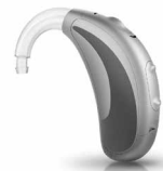
RS 13 P